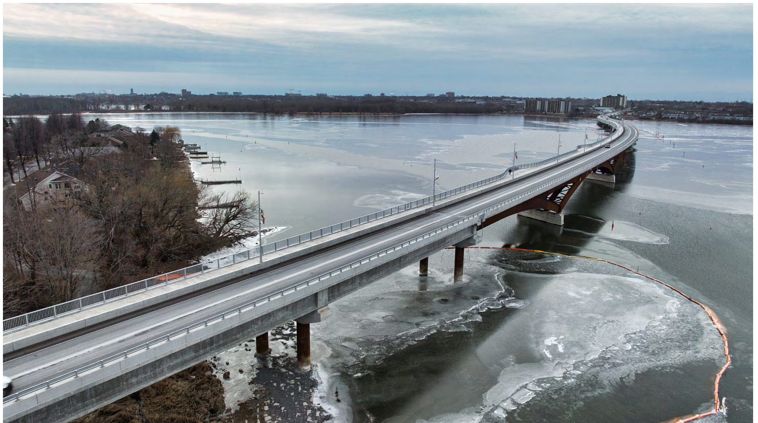
The Waaban Crossing, Opened To Traffic