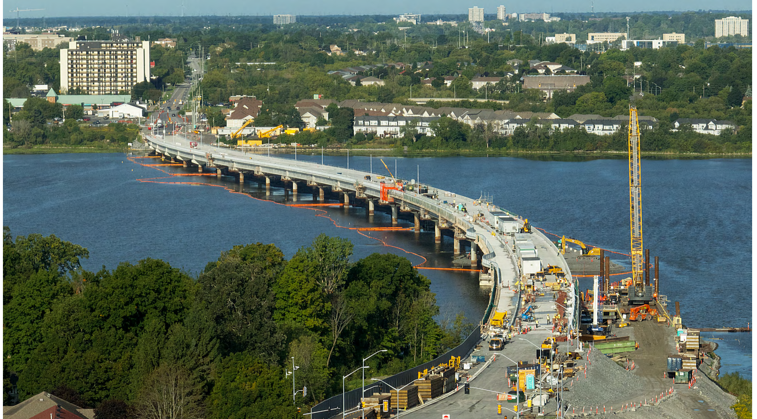
An Overview Of The Bridge Looking Westwards