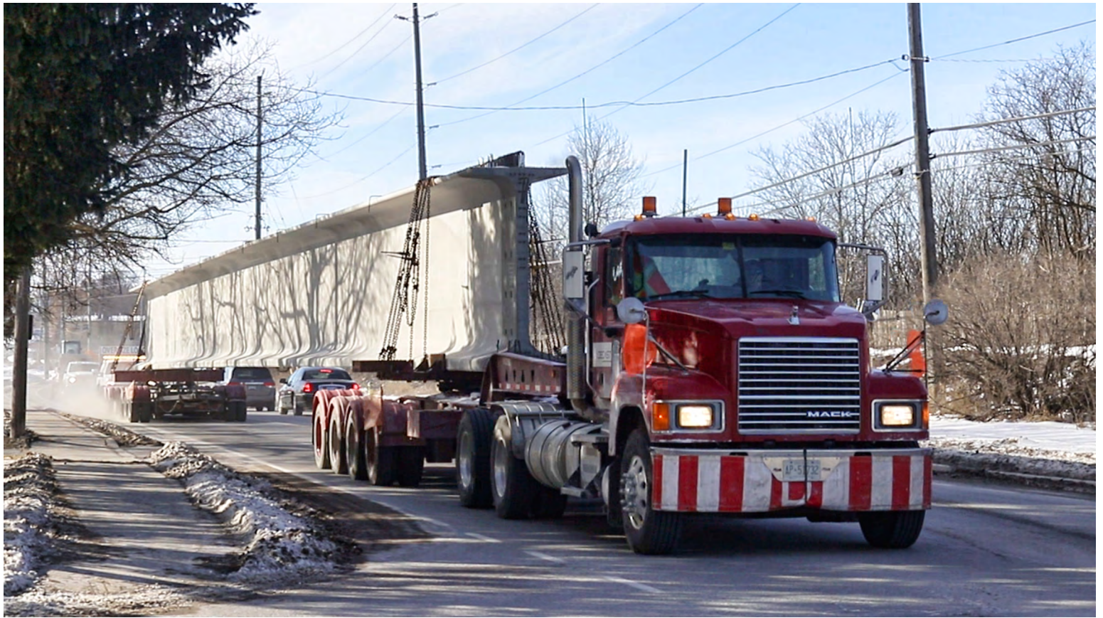
The First Of 95 Girders Arriving In Kingston