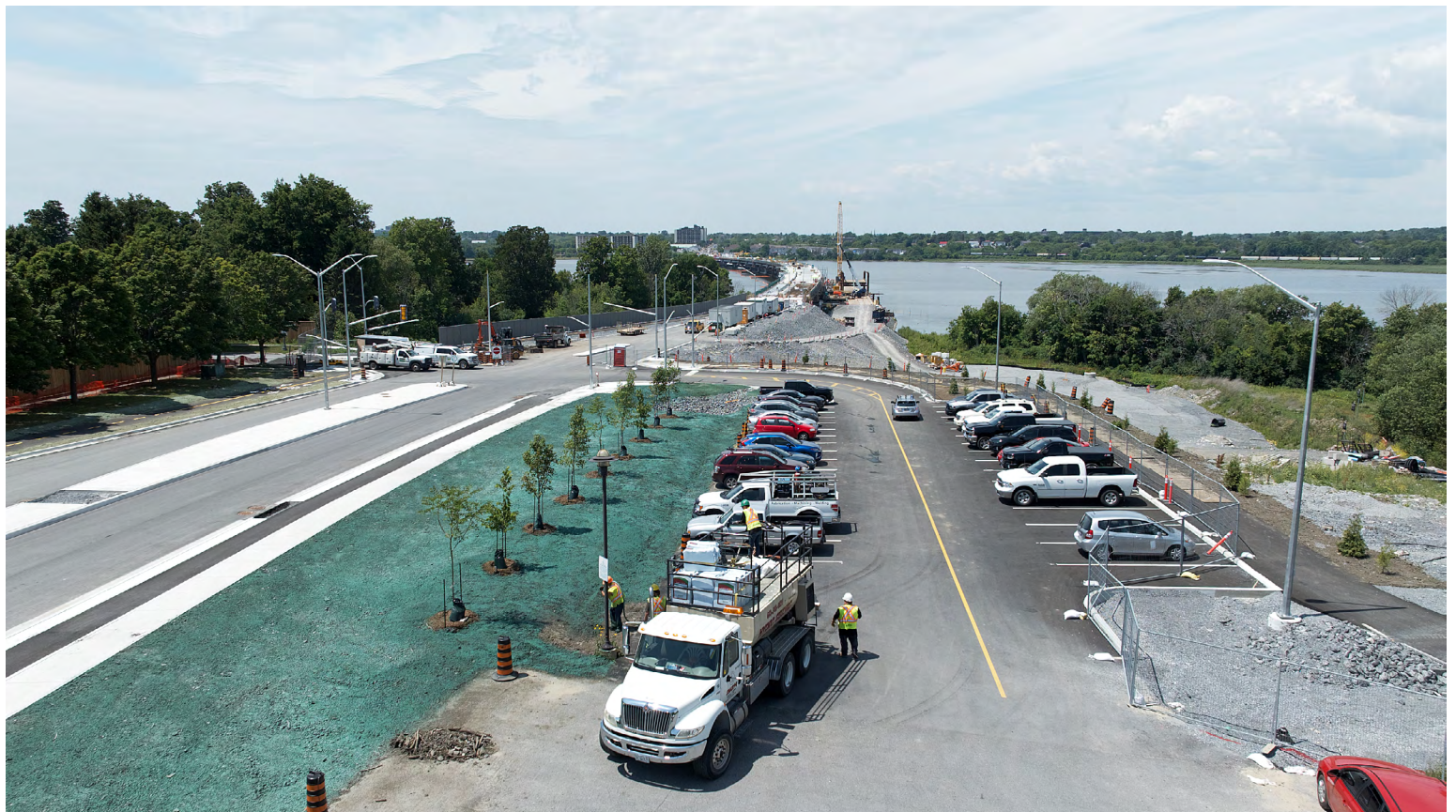
The New Approach Road (Gore Road) On The East Side