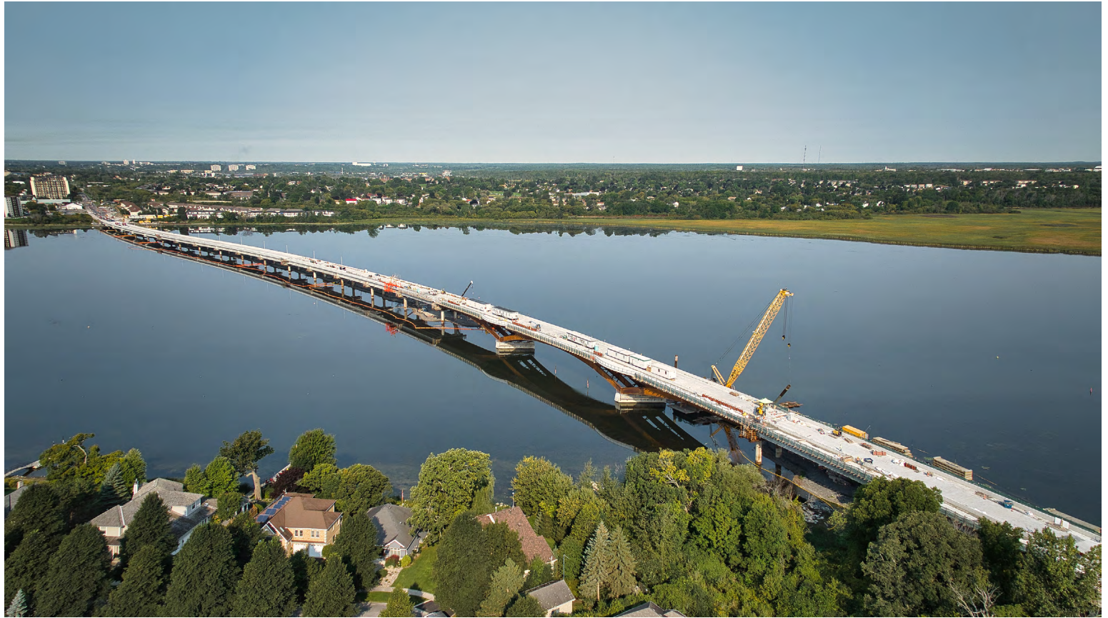
The Bridge Looking Westwards