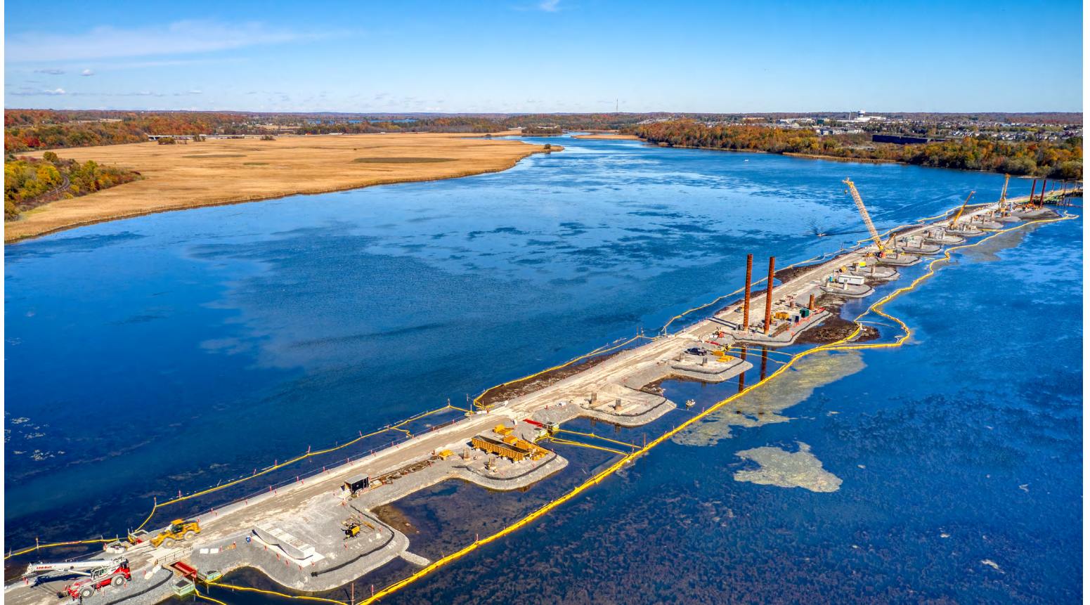
Piles And Pile Caps Being Constructed