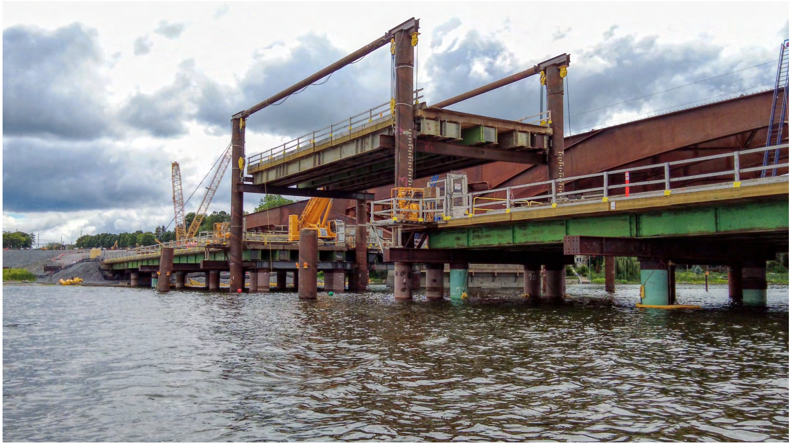
The Temporary Lift-Bridge Over The Cataraqui