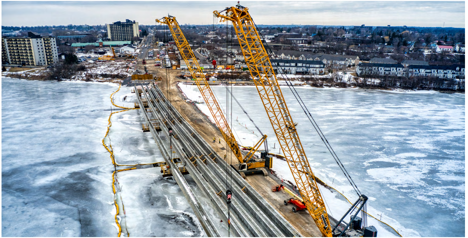
Two Cranes Sitting On The Temporary Causeway