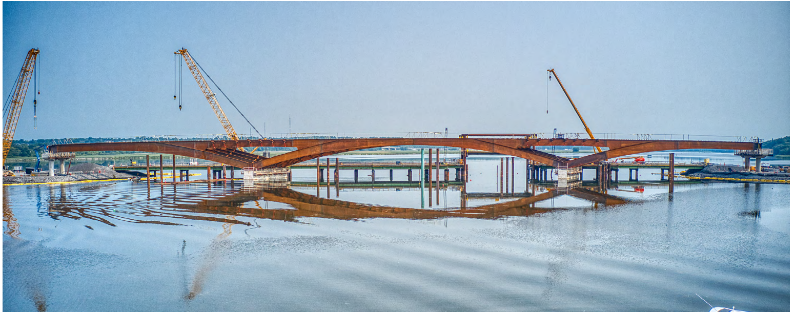
The Arch Of The Main Span Reflected In The River