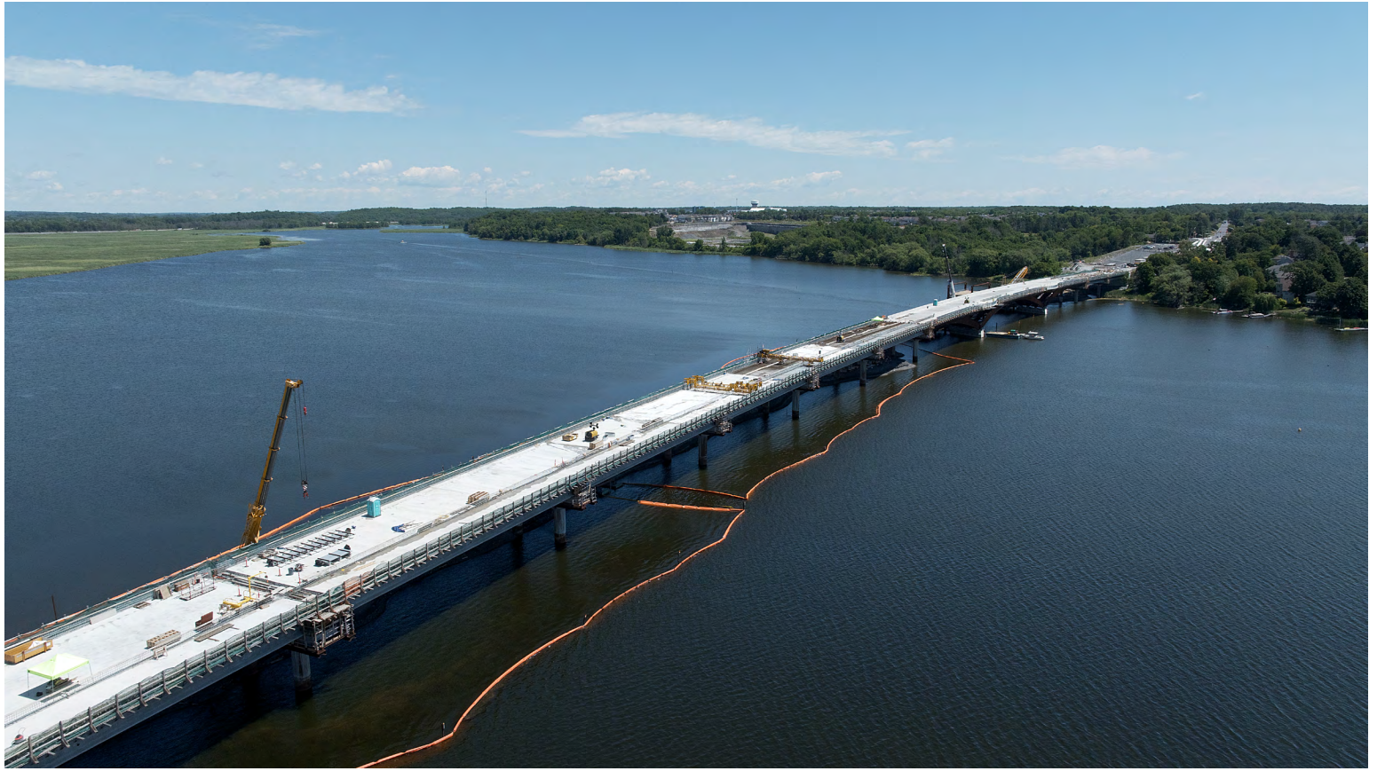
An Overview Of The Eastern End Of The Bridge