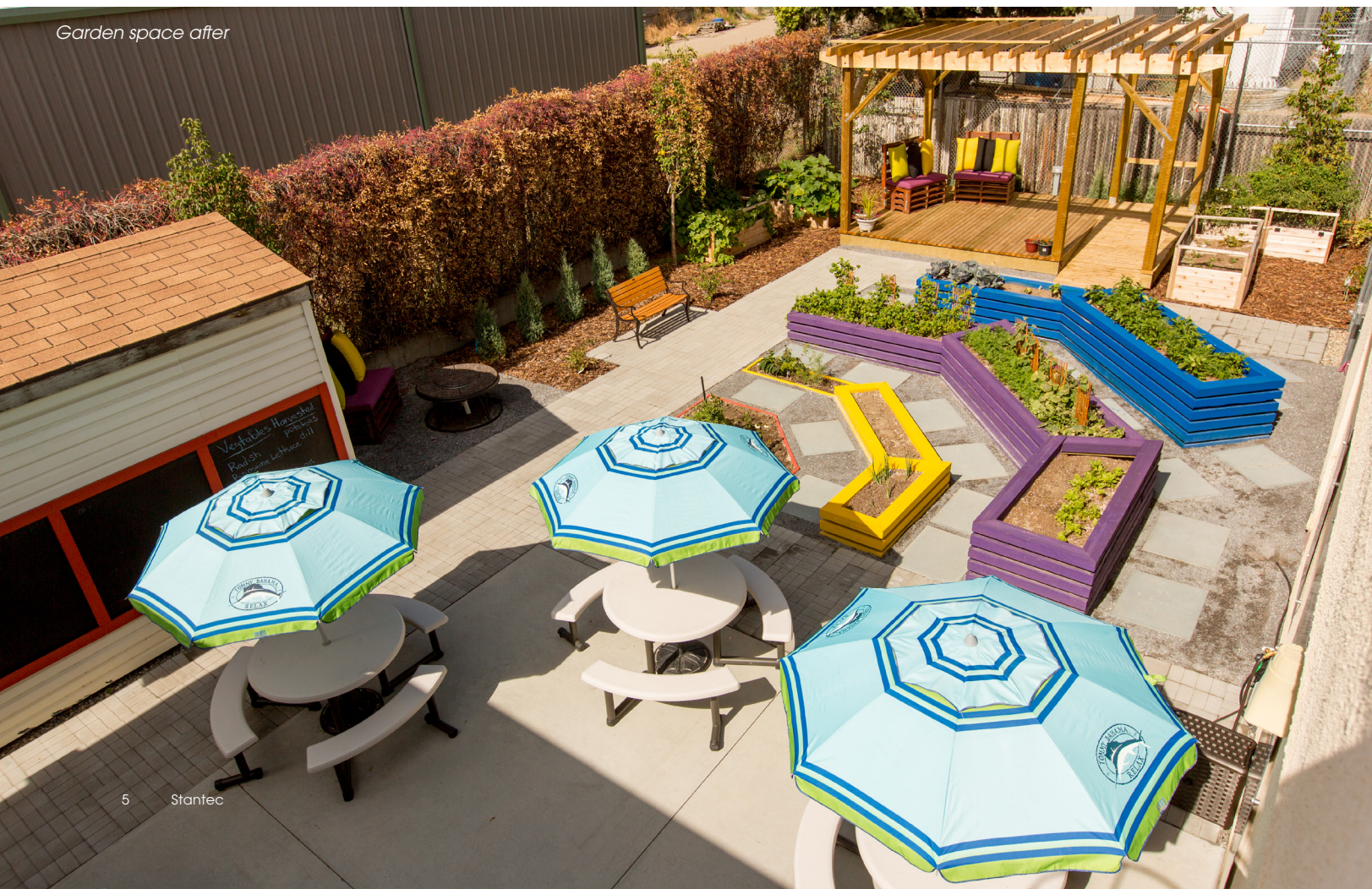
Garden space after