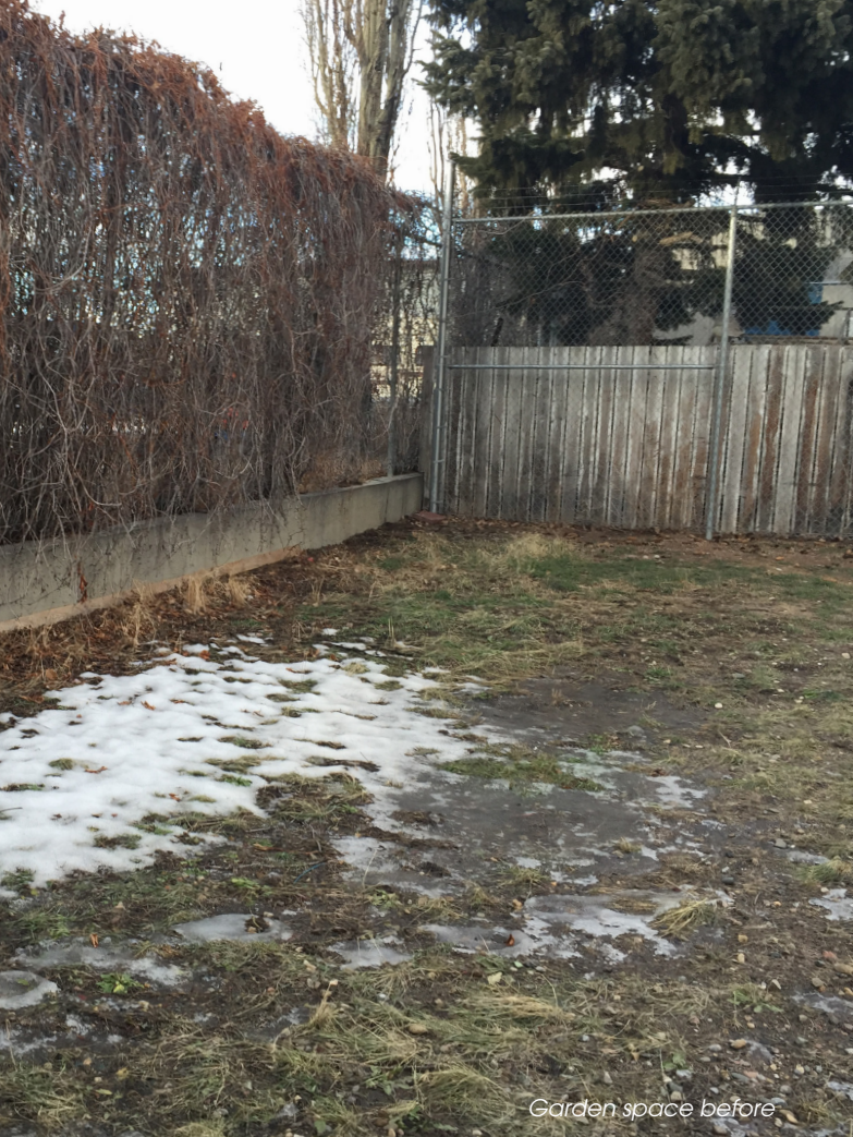
Garden space before