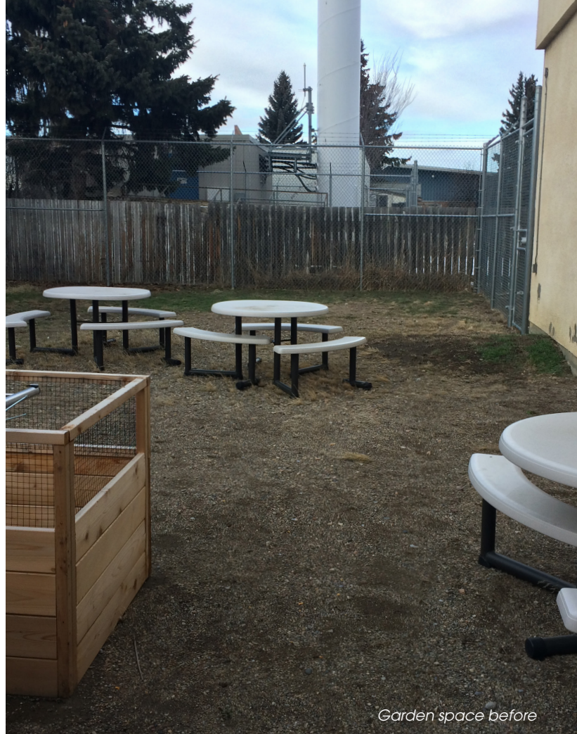
Garden space before