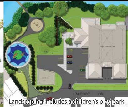
Landscaping includes a children's play park