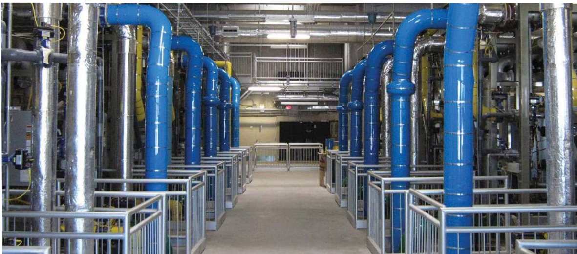
Membrane Gallery as-constructed