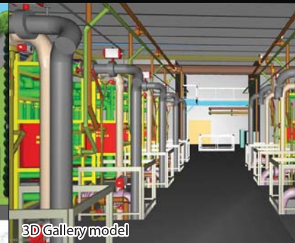
3D Gallery model