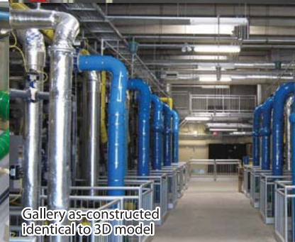
Gallery as-constructed identical to 3D model