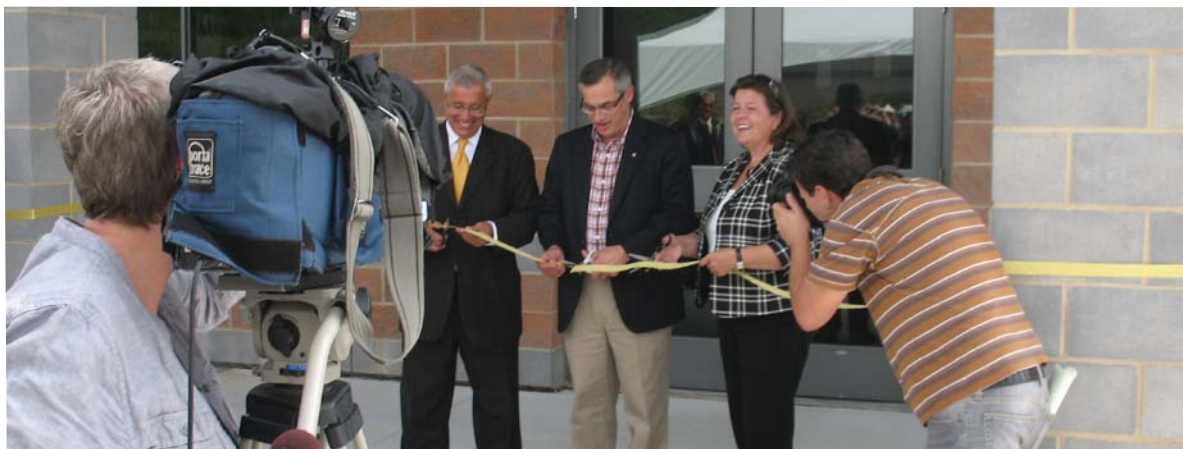
The North Bay Water Treatment Plant was officially opened in August 2010. Funded by the Government of Canada, Province of Ontario, and City of North Bay, this facility is a shining example of financial, environmental, and social sustainability.