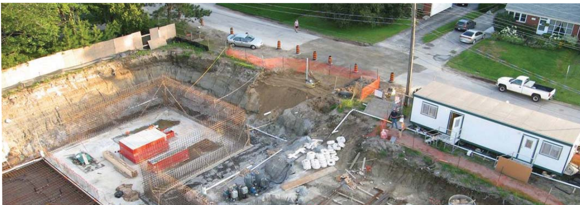
The facility is located on a tight site within a residential community.