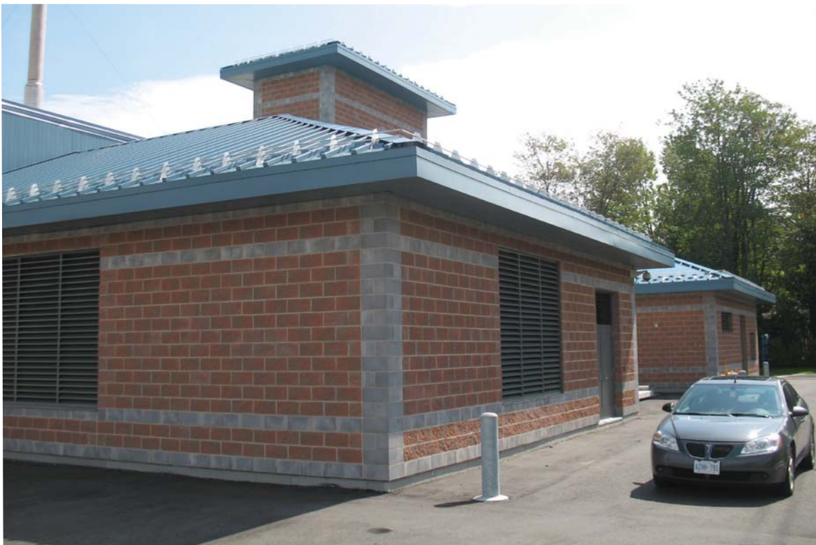
The building was designed to blend into this residential neighbourhood. The community contributed to selection of architectural materials during facility open houses.