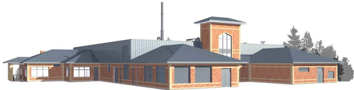
The North Bay Water Treatment Plant is an example of sustainability concepts used to lower overall life-cycle costs and garner community support.