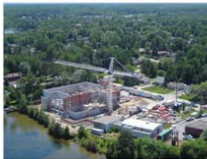
Water Treatment Plant Construction Site July 2007

Site work activity began early April 2006 and has progressed over the past two years. The majority of work to date has focused on construction of the building structure which is now complete and contains over 82 tonnes of rebar and 3000m 3 of concrete placed and finished. Major works completed include the installation of all 13 membrane filtration racks and installation of all 5 high lift pumps (350 HP each) that will feed drinking water to the City distribution system.