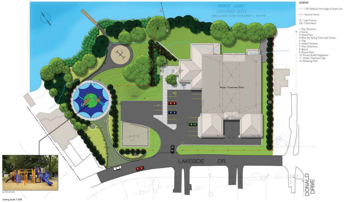
The landscaping plan integrates the facility into the neighbourhood, restoring the children's play park, using eco-friendly ground cover, and providing lake access for the community Blue Sky Sailing Club.