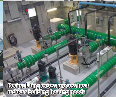
Recirculating excess process heat reduces building heating needs