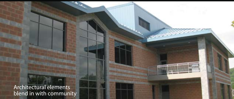
Architectural elements blend in with community