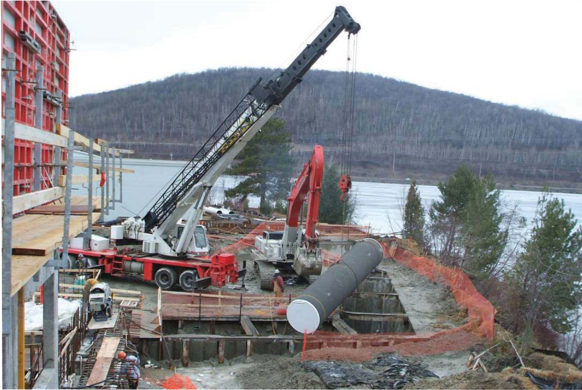
To enable construction on a high water table, the site was trenched and drained with 24-7 pumping over 2 years.