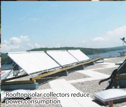
Rooftop solar collectors reduce power consumption