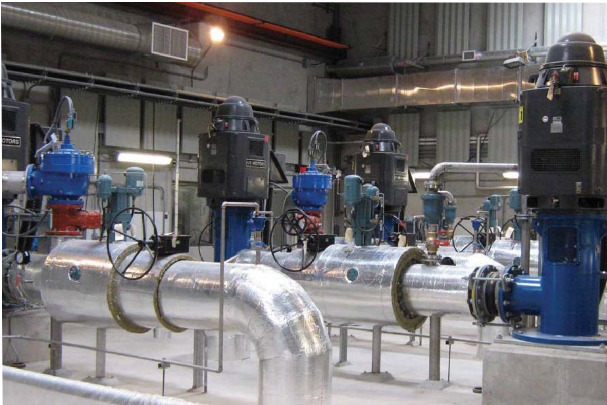
Smart planning transferred excess heat from spaces that did not need it to spaces that did.