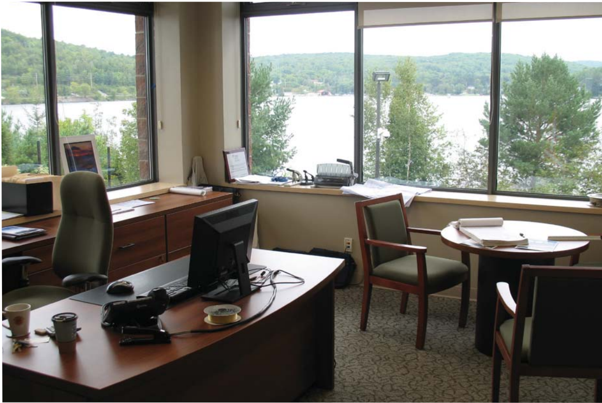
Window walls and architectural materials leverage natural light and a beautiful view to make great interior spaces.