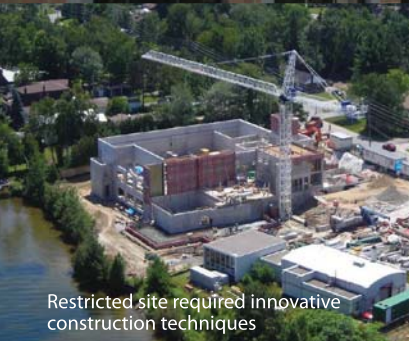
Restricted site required innovative construction techniques