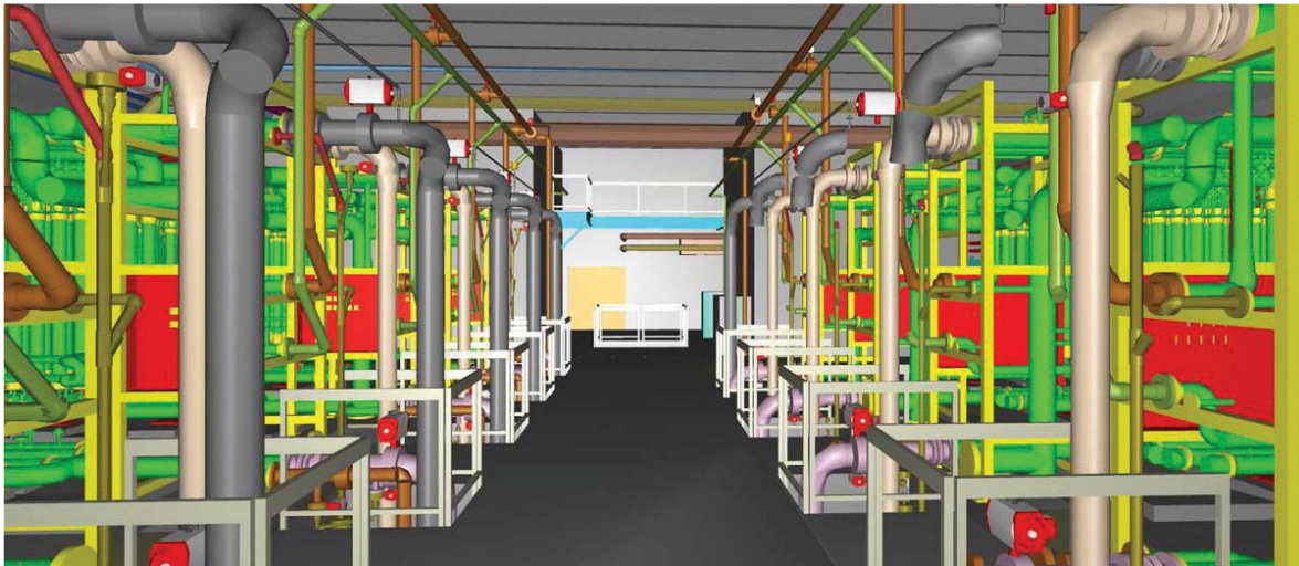
3D Model of Membrane Gallery

The completed 3D model allowed designers, operators, and City staff to virtually "walk through" the plant, allowing them to identify potential conflicts, and visualize the space before any construction began. Use of the 3D design also helped stakeholders such as City Council and local residents to understand and feel comfortable with the facility planning at an early stage.