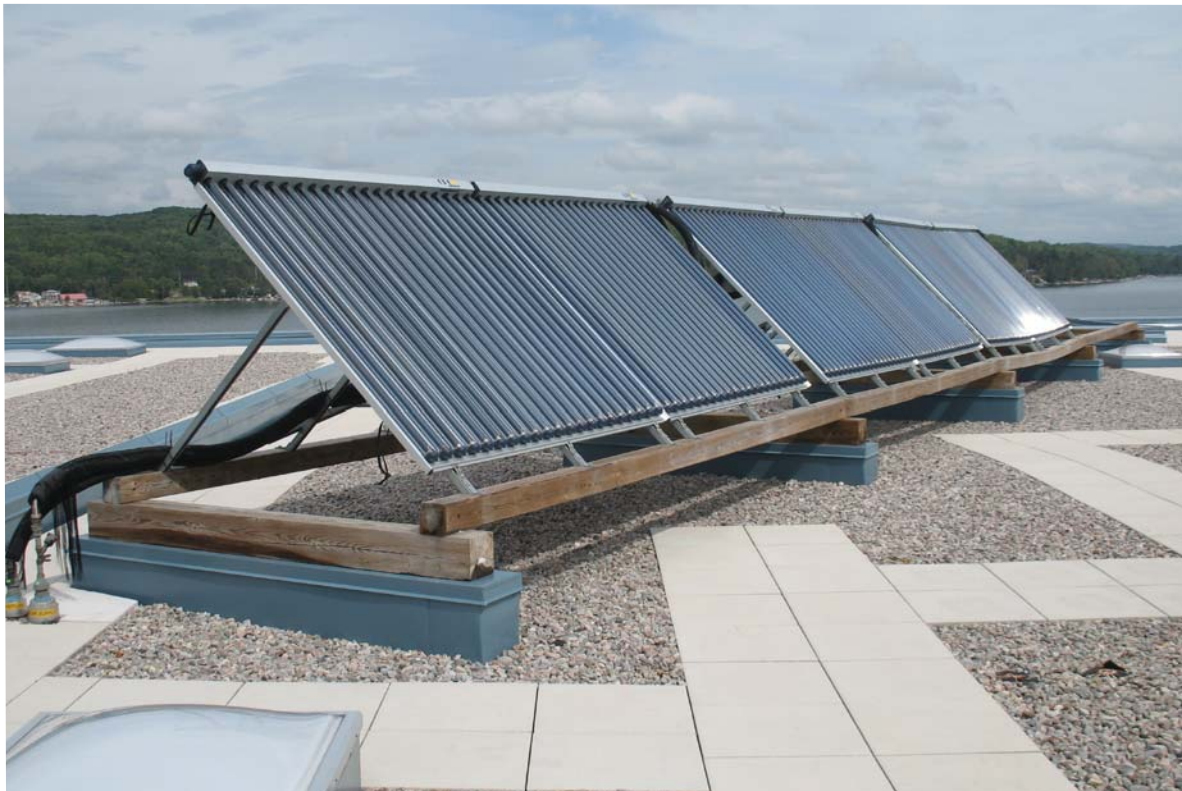
Rooftop solar collectors reduce energy burden.